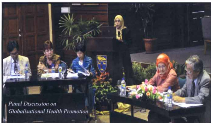
Panel Discussion on Globalisational Health Promotion

Similarly, three parallel dialogue sessions were held throughout the conference.