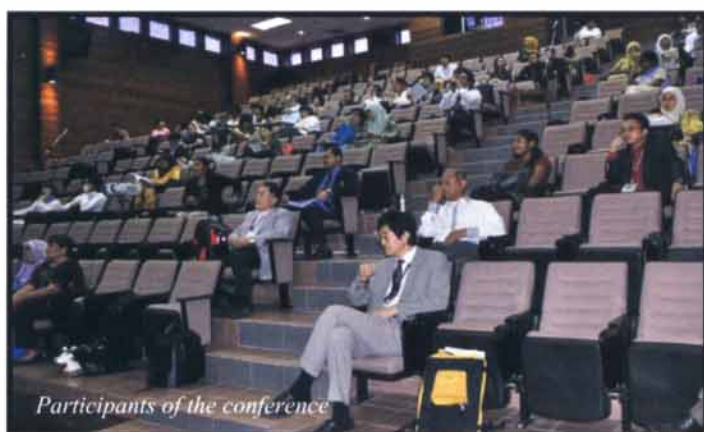
Participants of the conference