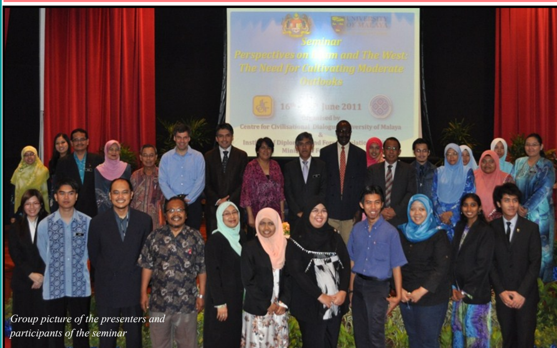
Group picture of the presenters and participants of the seminar

Seminar Perspectives on Islam and the West: The Need for Cultivating Moderate Outlooks 16 - 17 June 2011 Auditorium, Asia Europe Institute , University of Malaya