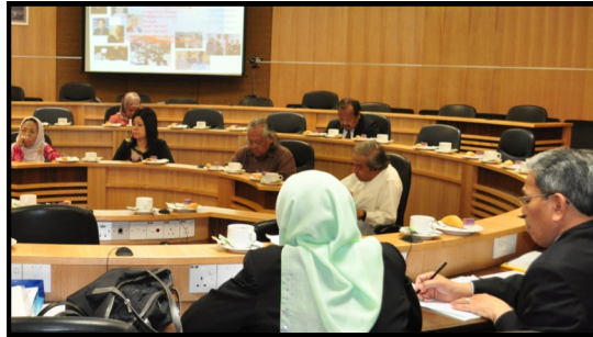
Advisory Panel listening attentively while the Director of UMCCD delivering her presentation